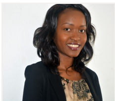
By Deliby Chimbalu