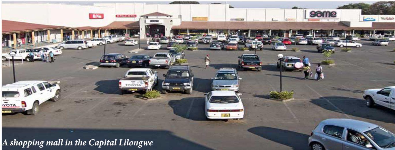
A shopping mall in the Capital Lilongwe